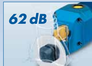
Very low noise level thanks to a patented anti-noise technology.