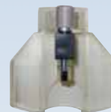
Vacuum nozzle Part #: T-CC-310-VN