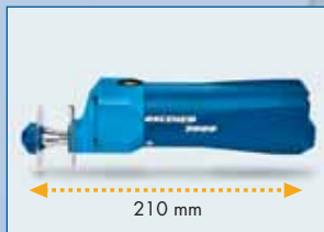
Usable with one hand thanks to its very short (8.25") and lightweight (1.6 lb) shape.